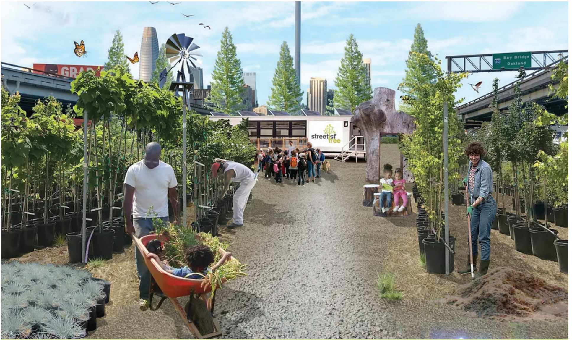
A landscape architecture rendering of the planned tree nursery.