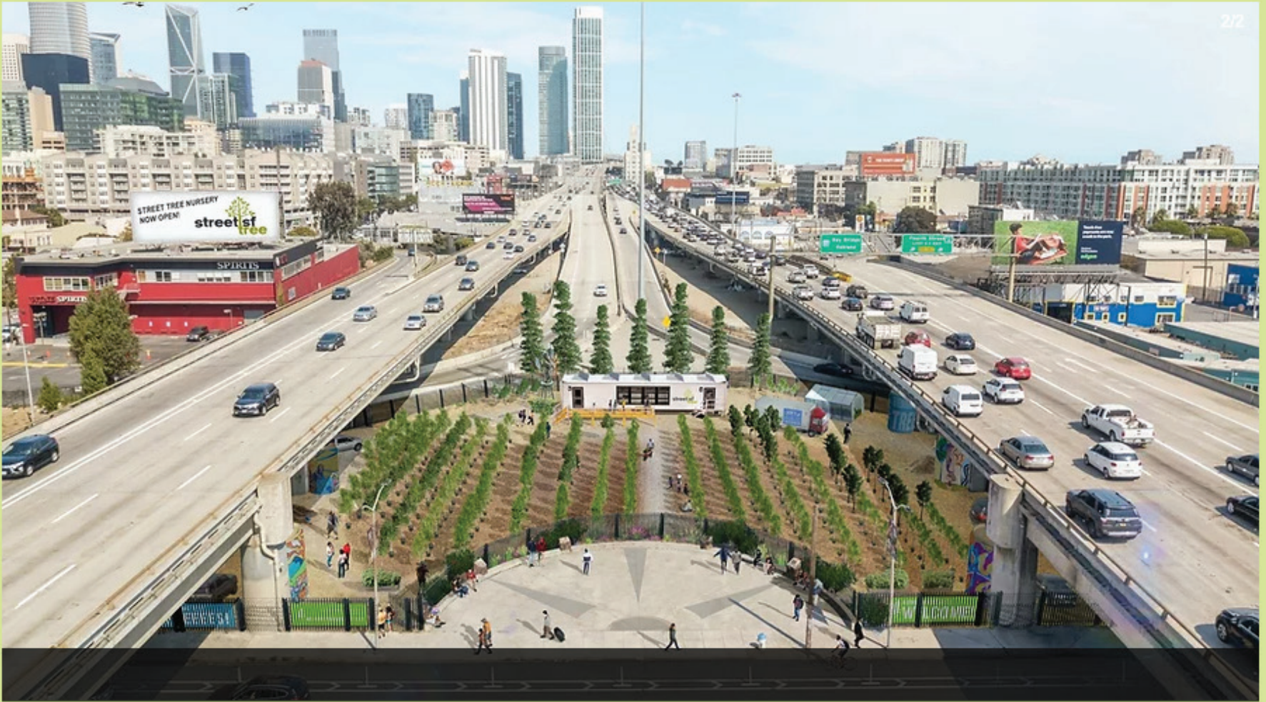
Envision the current site transformed by a tree nursery.

The grant program aims to improve unsightly land adjacent to the state's highways that all too often are blemished with trash and graffiti. The area around the ramps long has been a neighborhood eyesore.